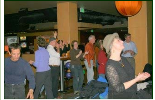
TNI Board and others enjoy a night of bowling in Denver.